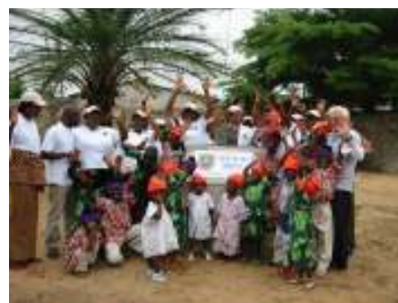
Orphanage in Allada