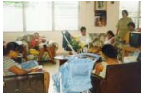
Panama. Young mothers' dwelling home