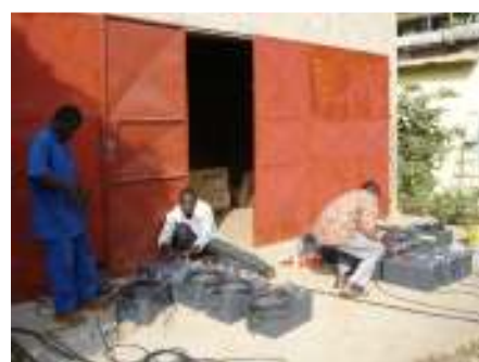
Electrical infrastructure for rural areas