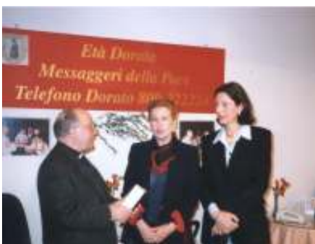
Golden Telephone Headquarters, Rome