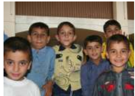
Dwelling home for orphans in Erbil