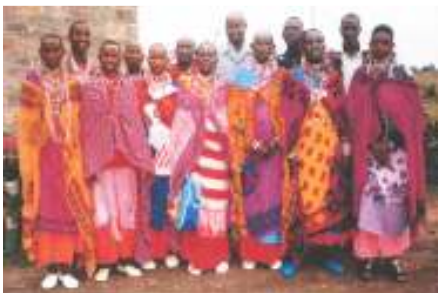
Project beneficiaries in Kaijado