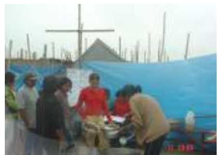
Peru. Assistance to victims of the earthquake in Ica