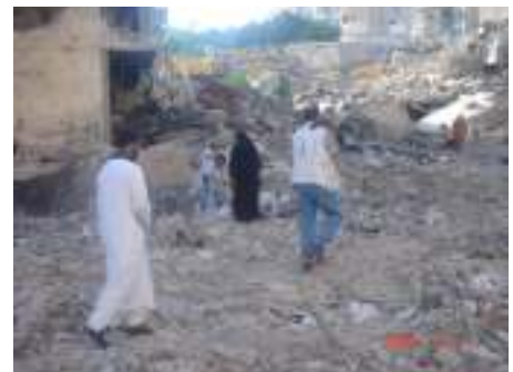
Assistance for victims after bombing attack, Beirut