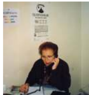
Golden Telephone Volunteer

The program has a significant impact on the mental health of participants , particularly for those who have recent optical disabilities , women who live alone and those who have little social contact .