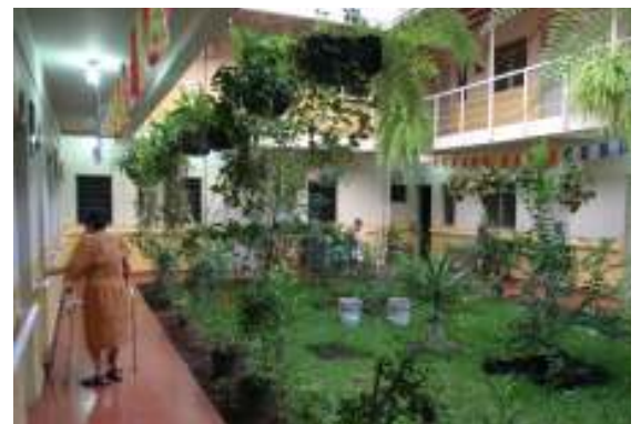
Residential home in Izalco