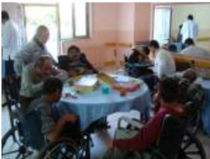
Jerusalem, Asylum for mentally disabled people