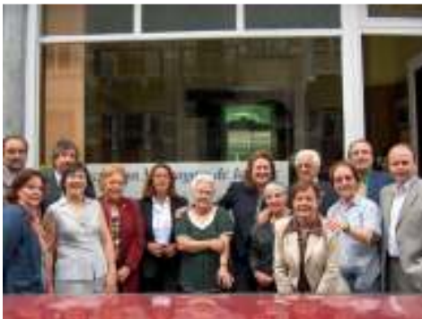
Staff and volunteers in Bruxelles