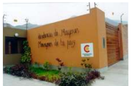
Peru. Residential home