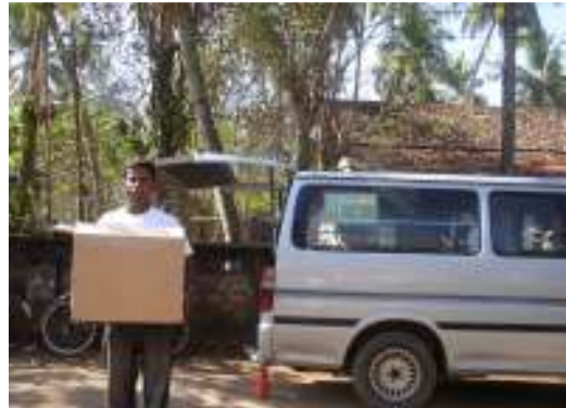
Delivering medicines and food supplies, Galle, Sri Lanka