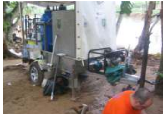
Installing systems to make drinkable water Galle, Sri Lanka