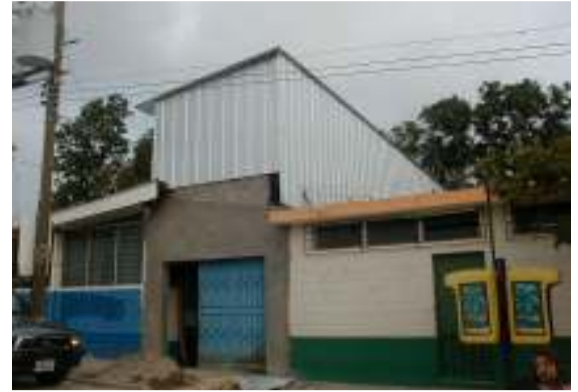
Community based magazine in Santa María de Otsuma