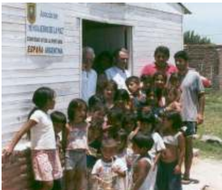
Community kitchen. Los Pozitos, Tucumán