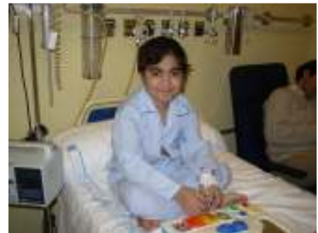
Afghan boy in a Spanish hospital