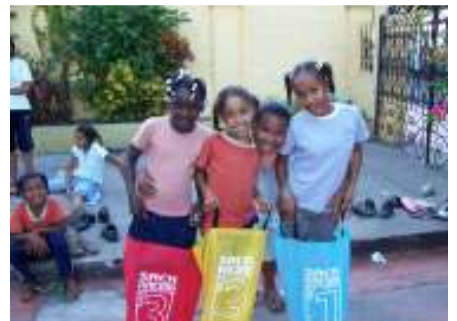
Dominican Rep. School-Home