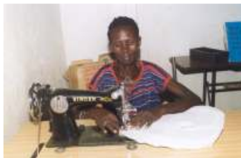
Making mosquito nets in Inharrime