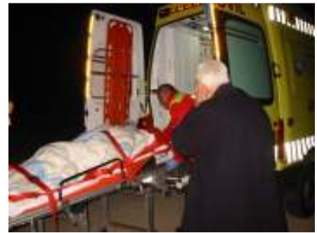
Damaged Iraqi children travelling to Spain for medical treatment