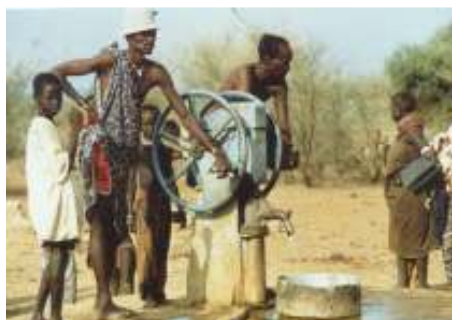
Agricultural improvement