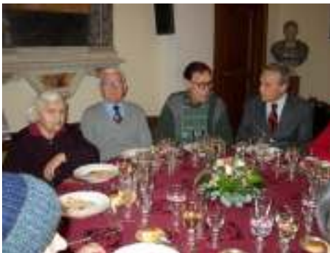
Christmas lunch for elderly people, Rome