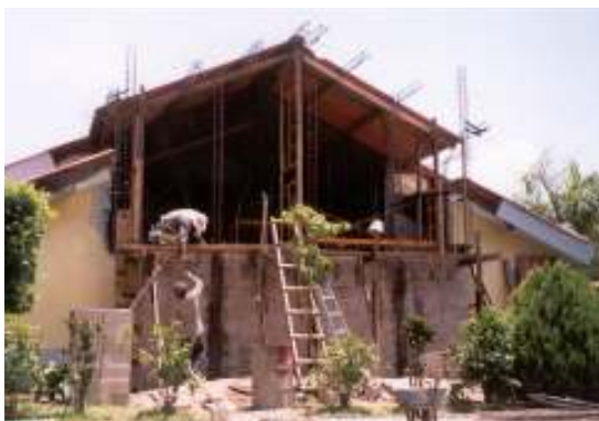
Reconstruction activities, Residential Home in El Amatal