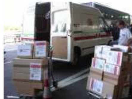
Paraguay. Medicines supply for burned people