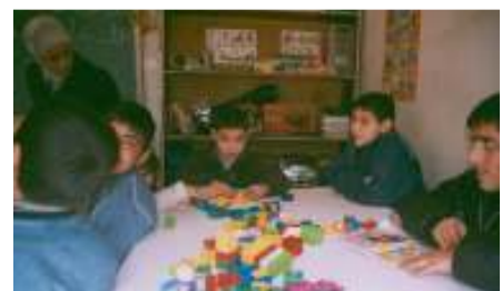
Centre for Disabled Children in Baghdad