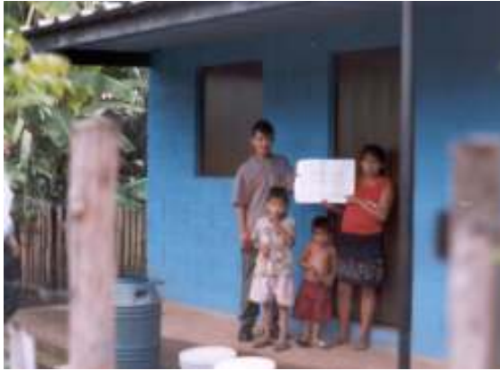
New Houses in Tepecoyo