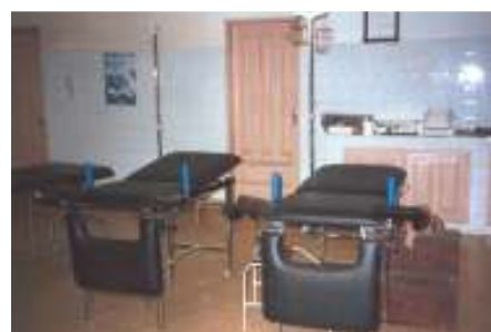
Birth room. Hospital in Sakkete