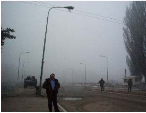
Rehabilitation of the electrical system Istuk, Kosovo