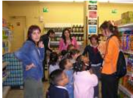
Family Conciliation Activity