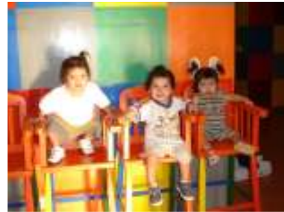
Dwelling home for children

Our organization is involved in several programs to promote children's rights and to prevent risk situations such as: