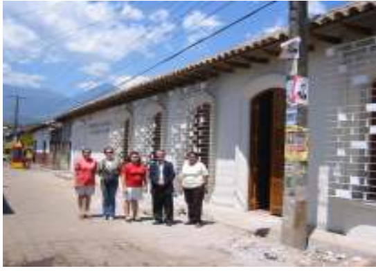
Residential home, Atiquizaya