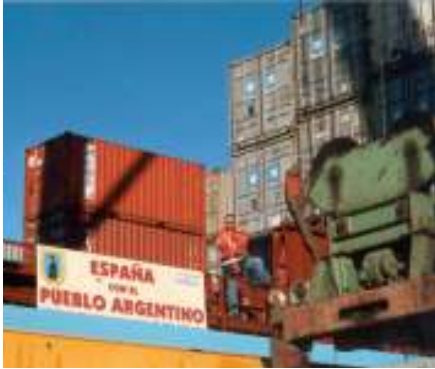
Humanitarian Aid for Argentina (2002)