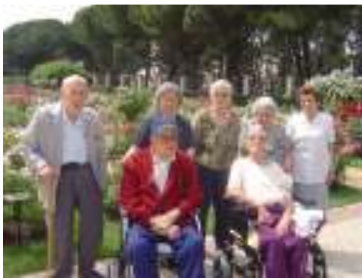
Cultural and leisure activities