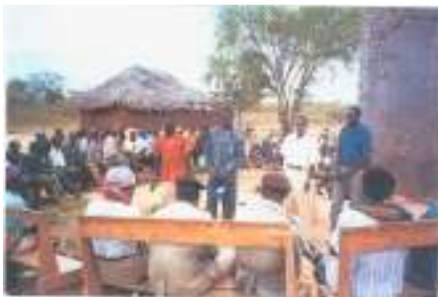
HIV/AIDS Information speech