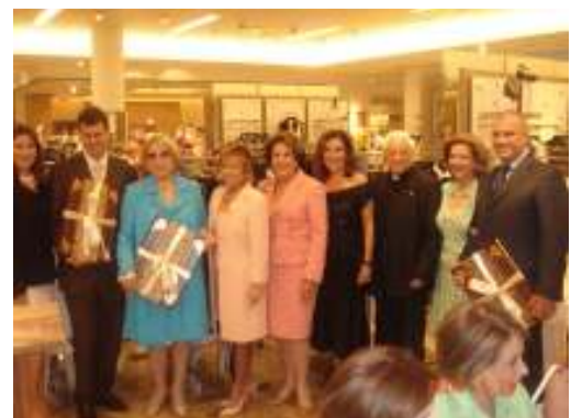
Charity event. Miami (Florida), USA