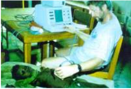
Hydatidosis Programme