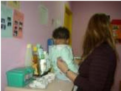
Day Care Centre

Children enjoying the benefits of the projects of "Messengers of Peace" belong to families in need of special support for various social and economic circumstances. Our Association provides them with resources to alleviate material, educational or affective needs of their environment or to welcome them whenever they have no family framework for whatever temporary or permanent , personal or social reason: orphans, abandon, non-structured families, non accompanied immigrants.