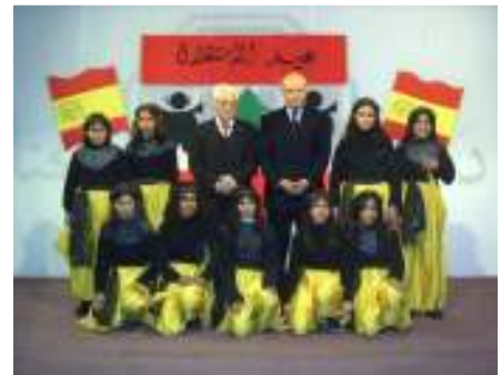
Orphans school, Beirut