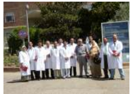
Training for Iraqi Doctors in Spain