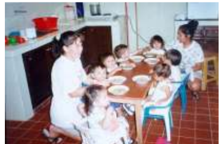
Bolivia. Nutritional support