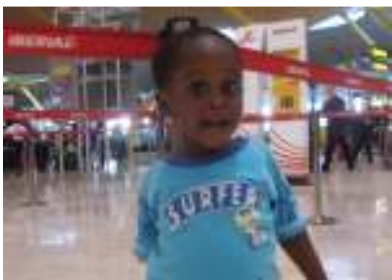
Leaving Spain after receive medical treatment