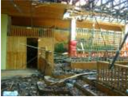
Gaza City. Social Centre after bombing