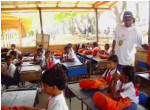
Scholar equipment supply Dumi, Sri Lanka