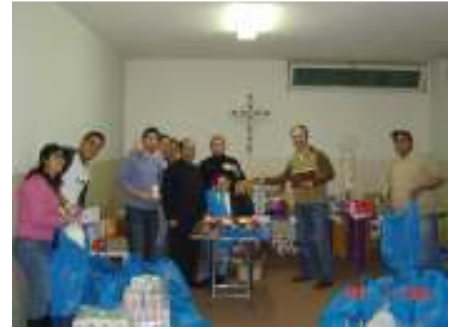
Donation of food and medicines. Amman