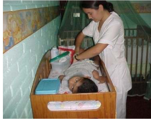
Dwelling Home, San Salvador