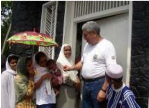
Medical assistance for the tsunami victims. Galle, Sri Lanka