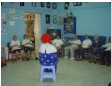
Therapy and Leisure

Every person is treated as an individual and is encouraged to develop himself. The love and respect we give to each person is just as we would like to receive ourselves. We strive to maintain a welcoming, secure and supportive atmosphere , within a comfortable 'home from home' environment.