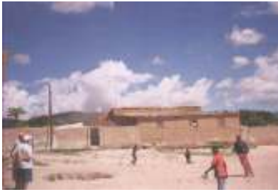
Sport field to be remodelling