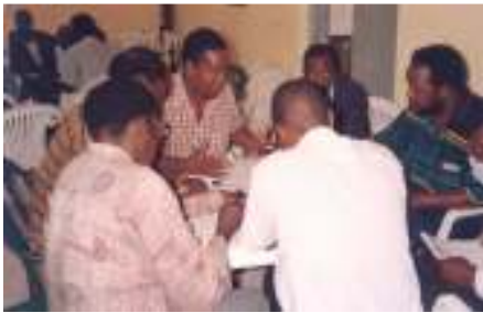
Local Leaders Programme