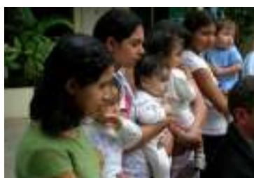
Dwelling home for teenage mothers