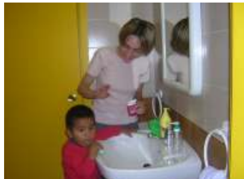
Family Health Program

This is why we are developing projects and programs, some of them pioneers in Spain and in other countries, aiming at fostering the reconciliation of labour obligations with family’s care. They are also designed to enhance common life among the family’s various members and to favour the full integration of neediest families thus avoiding social and coexistence risks.