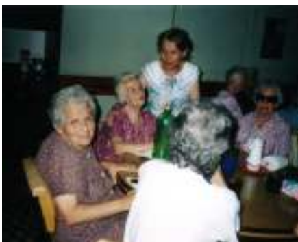
Day Care Centre for Elderly People. Buenos Aires City