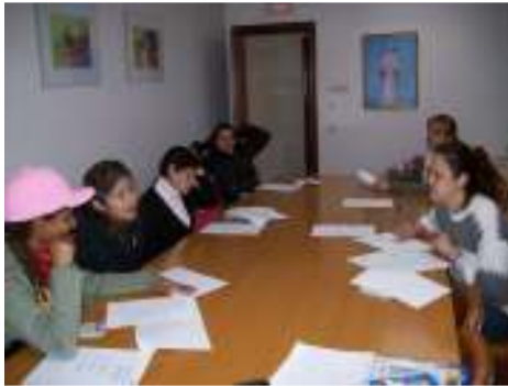
School for Mothers

For ‘Messengers of Peace’ family is the society’s essential pillar. Either within the traditional framework or according to modern patterns , family as constituted by adults and minors living together with affective links and sharing means, resources and experiences is the adequate framework for the person’s self assurance and right development.