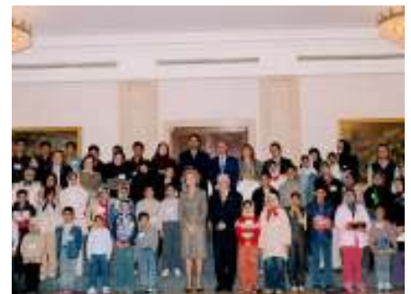
Madrid, Iranian Children from Bam visited by HM The Queen of Spain