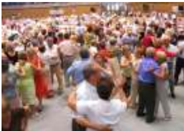
Grandparents' Day Party