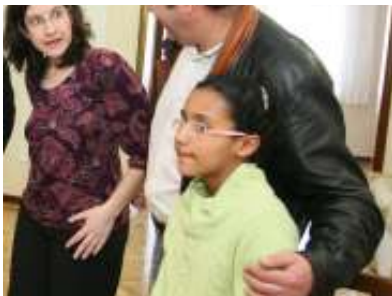
Algerian girl on medical treatment