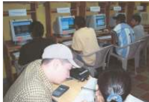
Computer Room. Virtual Library, San Salvador