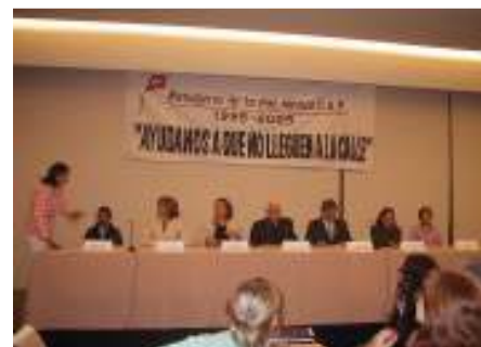
Mexico. Campaign Presentation