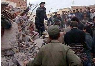
Earthquake damage in Alhucemas