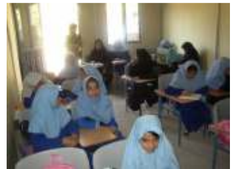
Bam, Iran. School for girls