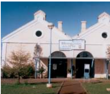
Community Centre. San Miguel de Tucumán