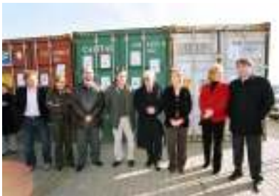
Medicines and food containers to Niger