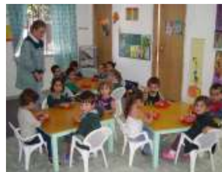
Uruguay. Educational Centre