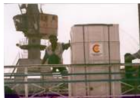
Humanitarian Aid arriving to Um Qasr (Basra Harbour)