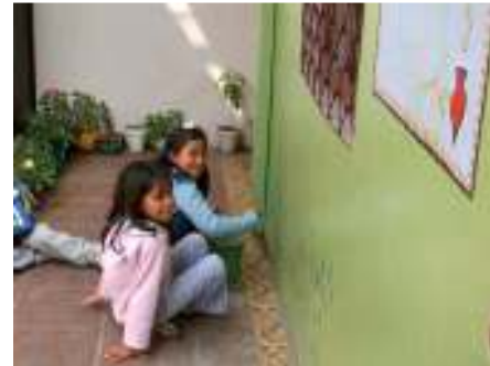
Ecuador. Children Care Centre