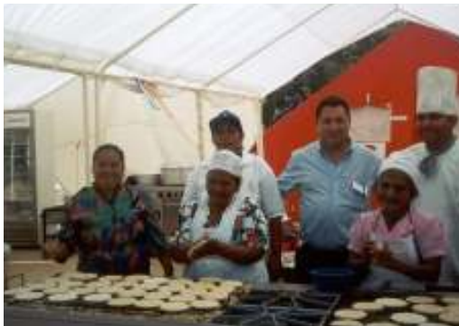
Assistance to victims of earthquake, Santa Tecla