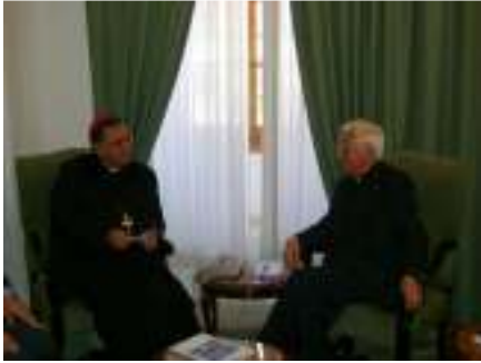
Jerusalem, Meeting with HB The Latin Patriarch