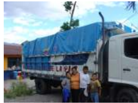
Ecuador. Farm-Home for children